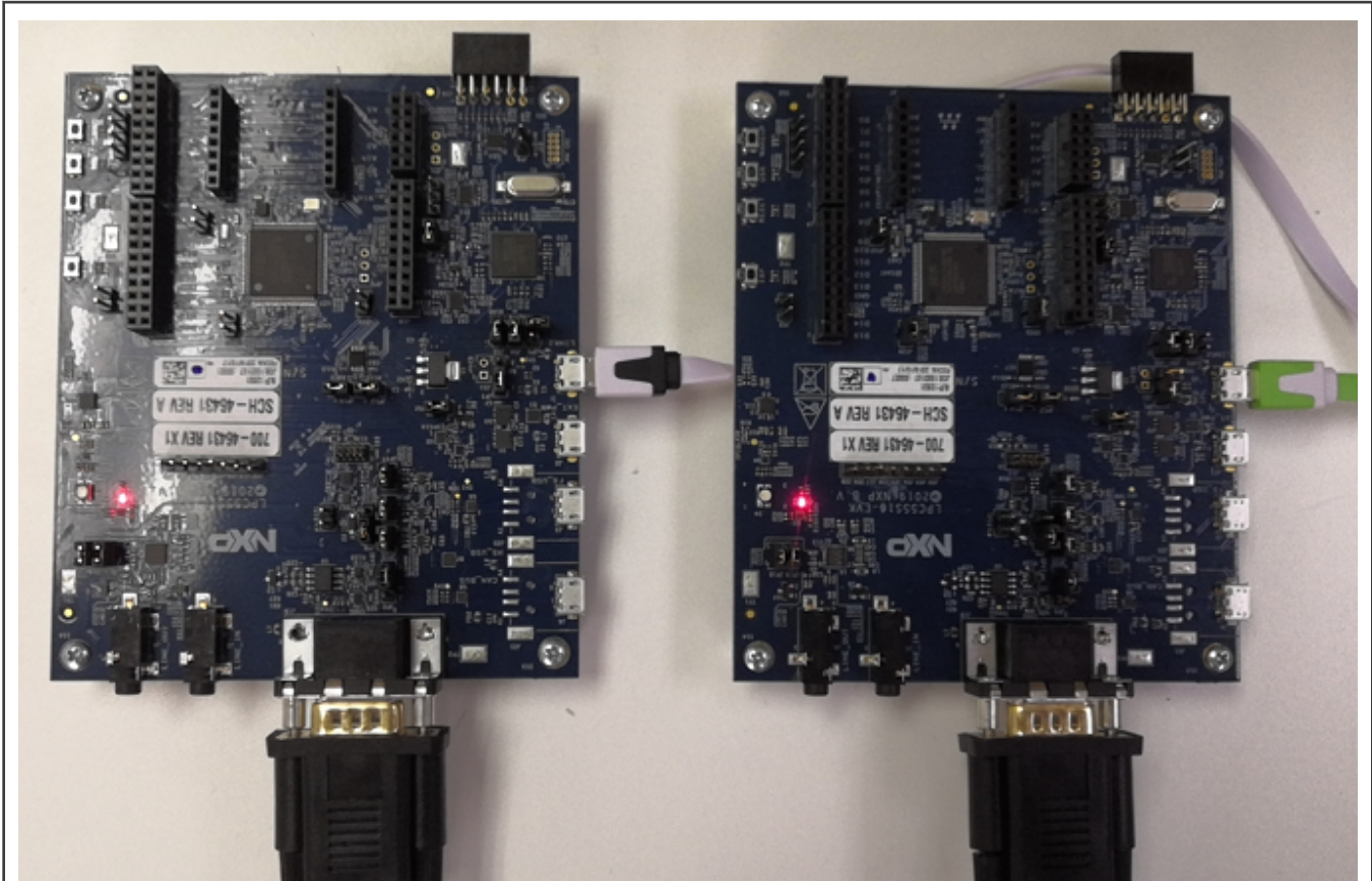
Figure 2. Boards setup and CAN connection