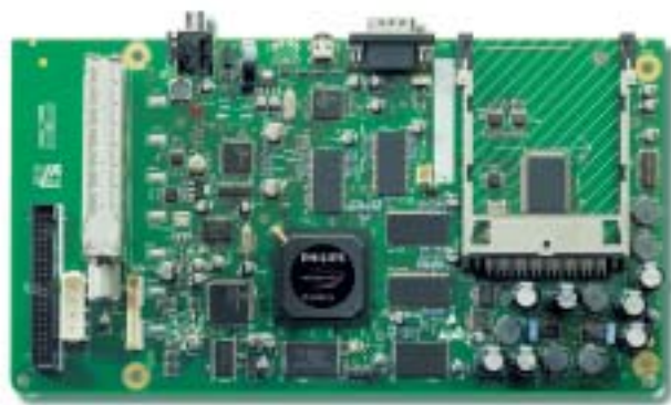
IBO2525-X Bolt-on Module