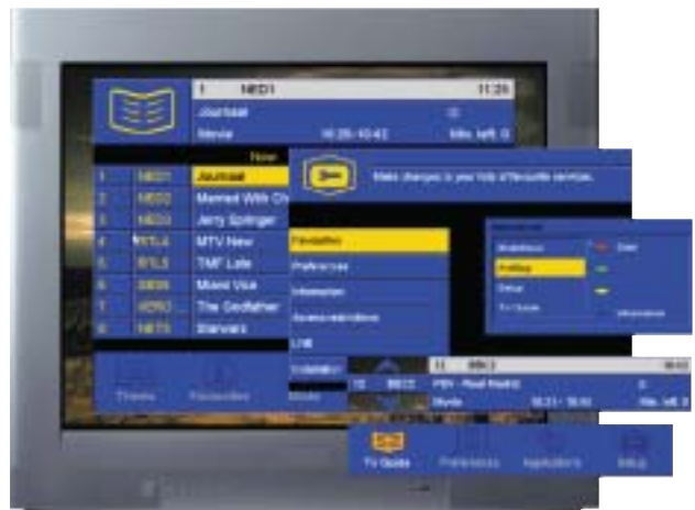
MHP 1.0.2. Middleware