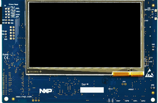
LPCXpresso54018 (OM40003) Development Board