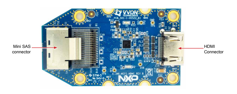
Figure 3: MIPI-DSI to HDMI Adaptor Card (included in the EVK) Note: (Color of the adaptor card may differ)