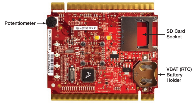
Figure 3: Back side of TWR-K40D100M board