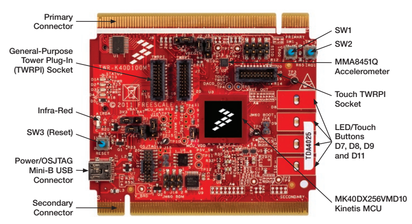
Figure 1: Front side of TWR-K40D100M board without Tower plug-in (TWRPI)