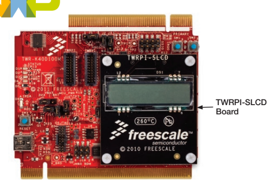
Figure 2: Front side of TWR-K40D100M board with TWRPI-SLCD attached