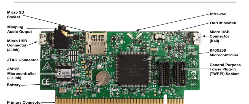
Figure 2: Back Side of KwikStik Development Board