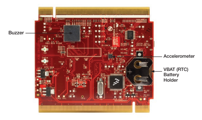
Figure 2: Back side of TWR-K20D72M board