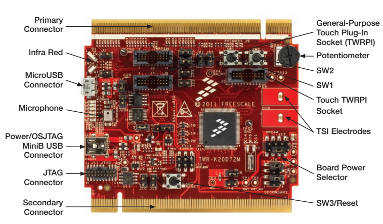
Figure 1: Front side of TWR-K20D72M board