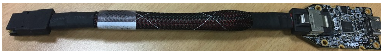
Figure 2. i.MX mini SAS cable with LVDS-to-HDMI adapter