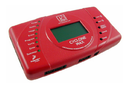
Figure 8-2: P&E's Cyclone MAX