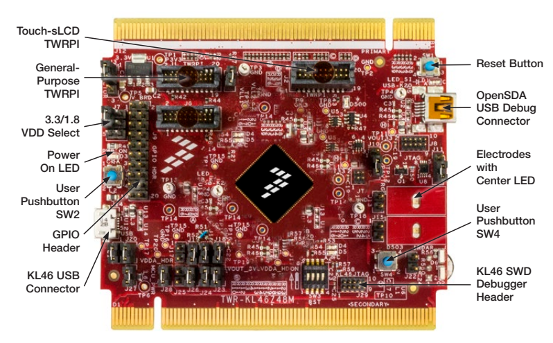
Figure 1: Front side of TWR-KL46Z48M board (TWRPI device not attached)