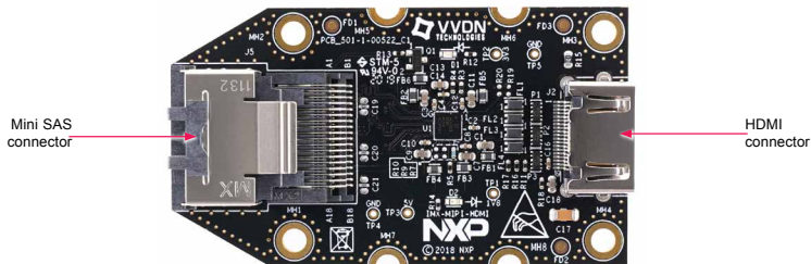
Figure 3: MIPI-DSI to HDMI Adaptor Card (included in the EVK) Note: (Color of the adaptor card may differ)