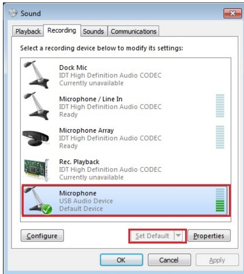
Figure 4: Set default