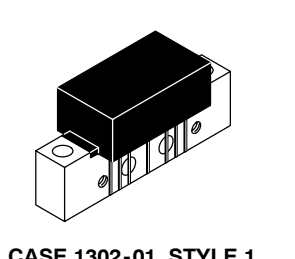
CASE 1302-01, STYLE 1

5-65 MHz, 25.5 dB, 10-CHANNEL CATV LOW CURRENT AMPLIFIER MODULE