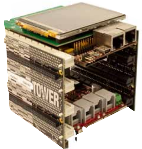
Figure 1. The TWR-MPC8309-KIT made up of the TWR-MPC8309, TWR-INDCTRL and TWR-ELEV modules. Mounted on the TWR-MPC8309-KIT is the optional MPC830x-TLCD module.