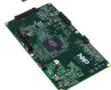
MCU control board (EV-CONTROLEVM)