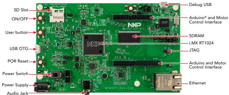
Figure 1: MIMXRT1024-EVK callouts