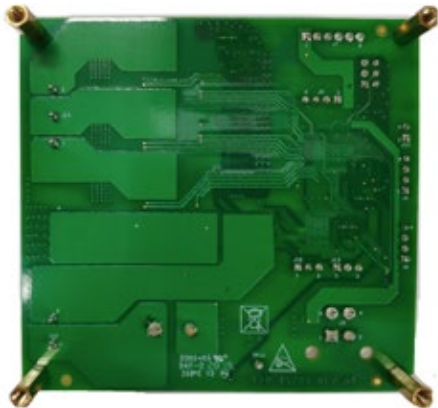
Figure 2: Back side of S12ZVM-EFP RDB