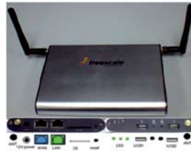
Figure 4 – Freescale nSEG reference platform

For applications that do not require high performance broadband connectivity or full 802.11n Wi-Fi, Freescale also offers the i.MX28-based Home Energy Gateway (HEG) reference design. The Freescale HEG reference design is a compact (3.3”x3.0”), scalable, low power form factor based reference platform featuring: • A powerful, low power consumption applications processor