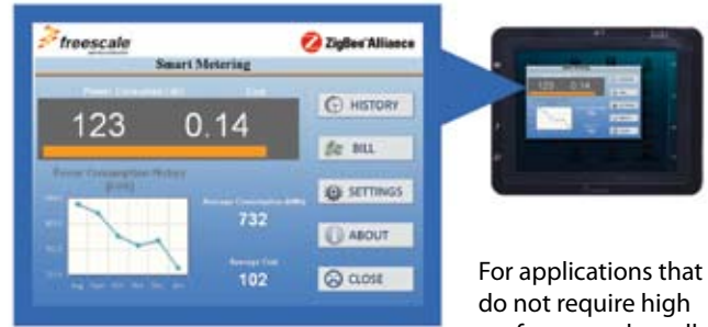
Figure 3 – Graphical user interface

The Freescale nSEG is being demonstrated at global technology and smart energy conferences today, and can be ordered using this part number: MPC8308SBC-SA.