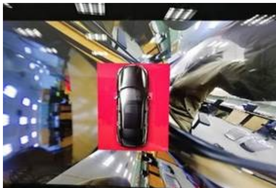
Figure 3. All cameras' views on the display