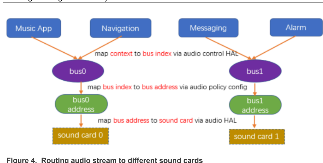
Figure 4. Routing audio stream to different sound cards

as music are played from the extended audio board. The following are steps to change the route. For example, music and navigation go through the extended audio board, and others go through the audio jack on the CPU board.