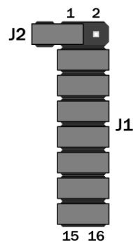
MON08 Connector Jumpered for Standalone Mode Operation

In order for the IDB-HC08JK Evaluation Board to work in standalone mode, the MON08 connector's pins must be jumpered as show below (factory setting).