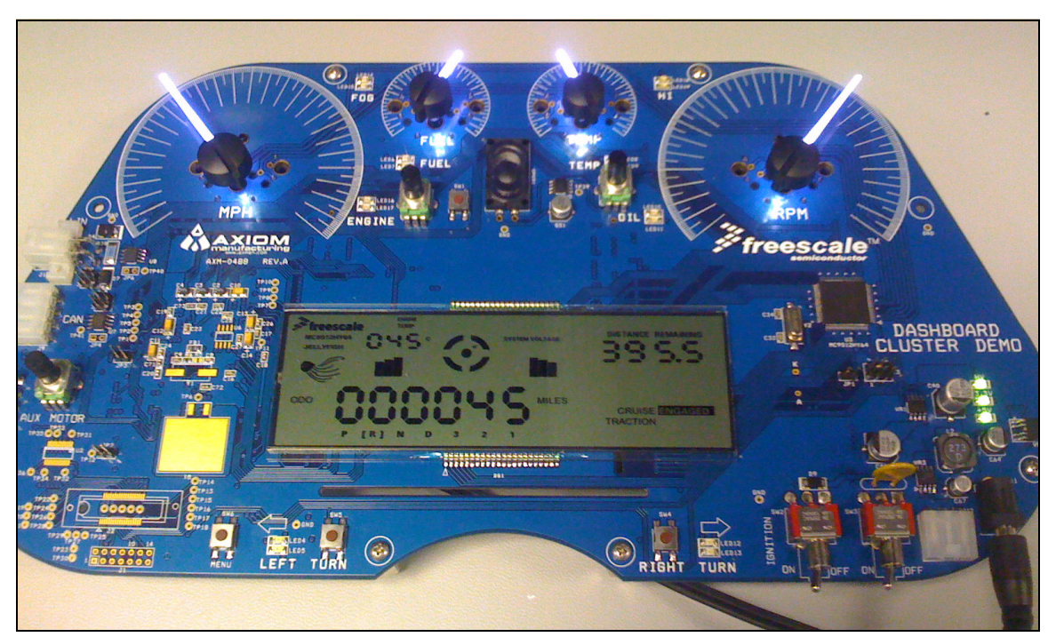
Figure 1. MC9S12HY Dashboard Cluster Demo Board