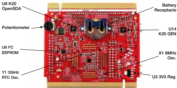
Figure 2: Back side of TWR-KM34Z50MV3 module