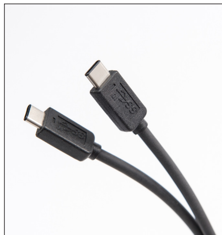
Figure 1. The Type-C connector is smaller and flippable.

One of the most noticeable things about the Type-C connector is that it's quite small – it measures just 8.3 x 2.5 mm – and it's vertically symmetrical. Similar to the Apple Lightning connector, the Type-C connector has contacts on both sides, so it works the same either way. There's no more up or down, and no more fumbling with the plug, trying to figure out the right way to insert it.