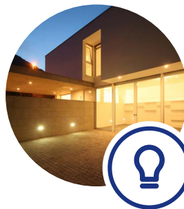
Lighting Management Systems