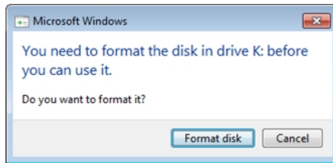
Figure 1: Format the disk

When the format is completed, the computer will display the capacity of 4k removable disk.