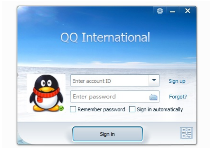
Figure 2: Login the test tool