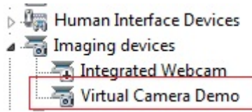
Figure 1: The video device is attached