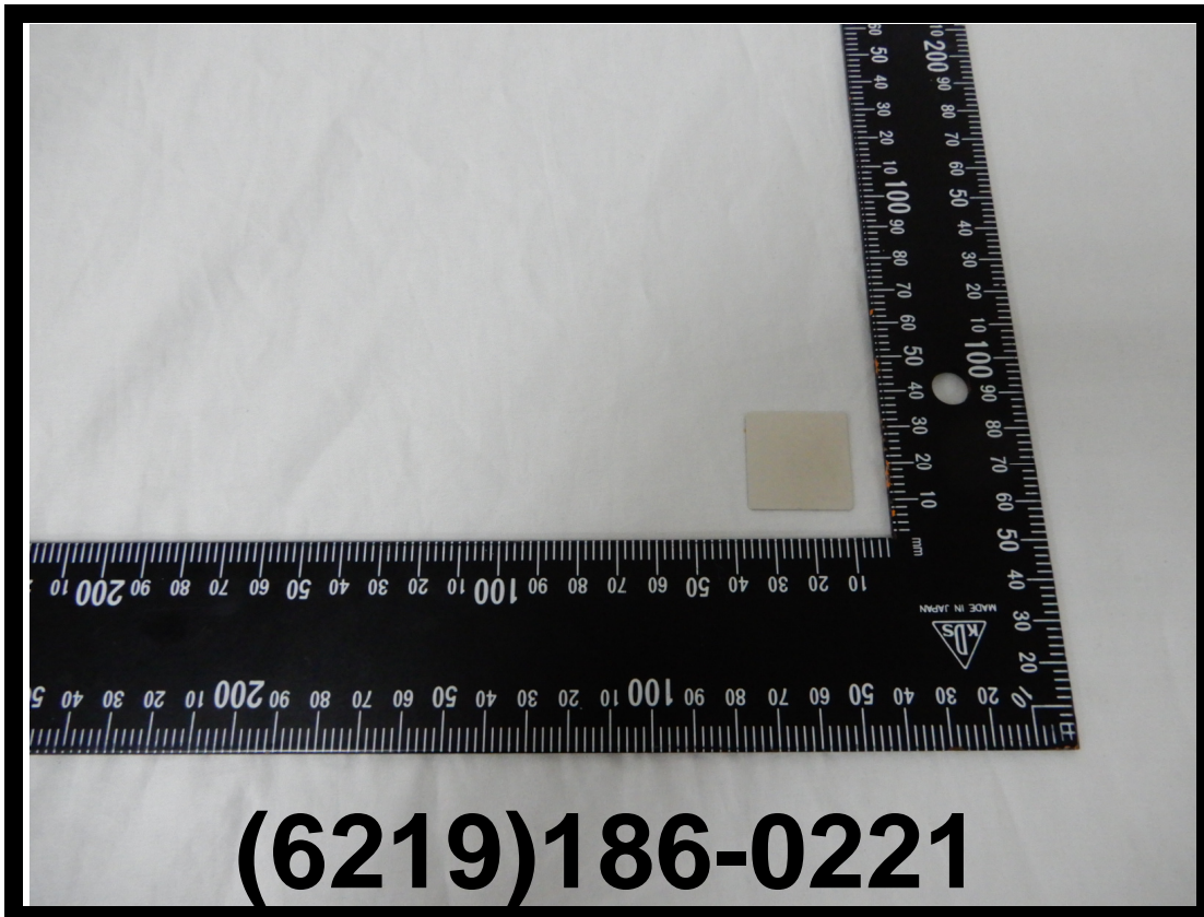
Photo of the Submitted Sample 委送樣品照片

Lab No. : (6219)186-0221 Date : July 11, 2019 Page : 6 of 8